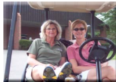
Friends of MHAM take a moment to rest after the round of golf.