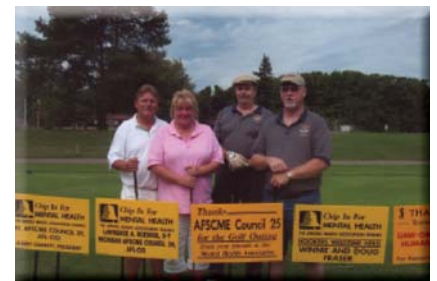
Golfers pose with sponsor signs before the start of the tournament.

Brookwood Golf Club www.brookwoodgolfclub.com