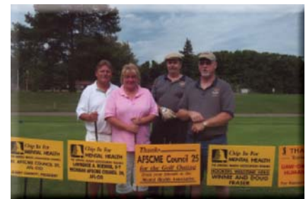
Golfers pose with sponsor signs before the start of the tournament.

Brookwood Golf Club www.brookwoodgolfclub.com