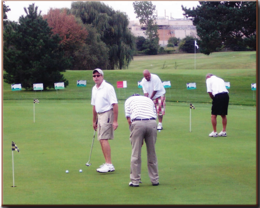
Golfers warm up before tee-off at the 16th Annual Golf Outing